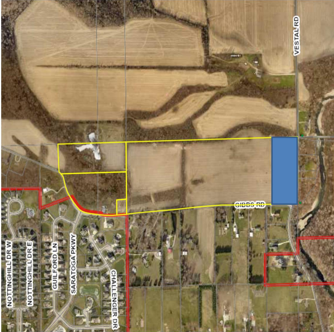
EXHIBIT A (Blue Block Excluded)